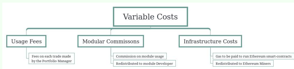
FIGURE 2. Variable Costs of a Melon protocol portfolio